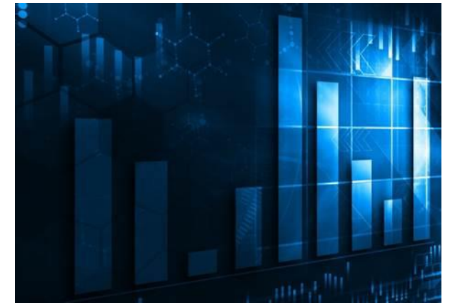
OUR CONSULTING intrinsic value: health & retirement