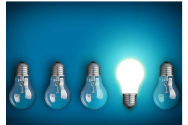
OUR KNOWLEDGE global insight augments local expertise