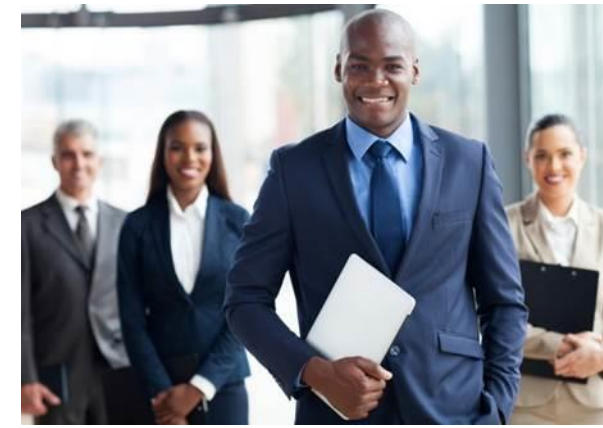
OUR PEOPLE 140 employee benefits & risk experts

Nicol Main Office Park, Block D, 2 Bruton Road, Bryanston, Gauteng, 2191 JLT Employee Benefits SA (Pty) Ltd. An Authorised Financial Services Provider and Member of the JLT Group plc