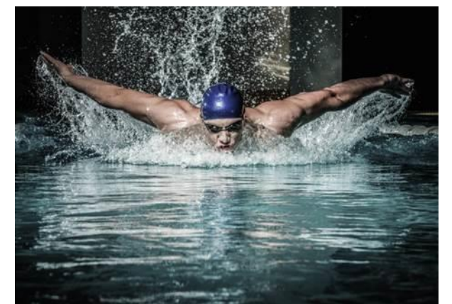
OUR COMMITMENT helping clients achieve results